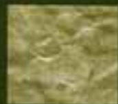
Tandor D GWS

A touch of metal, perfect for a more modern look.