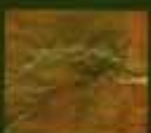
Terra Cotta Bronze