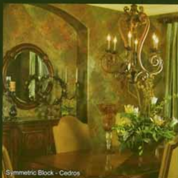
Symmetric Block - Cedros