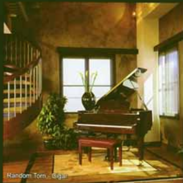
Random Torn - Silver