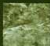
Dark Forest II

Our tried and true signature series of elegant finishes.