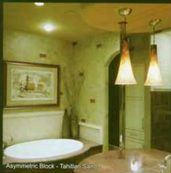
Asymmetric Block - Tahitian Sand