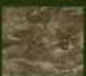
Evening Lilac WS