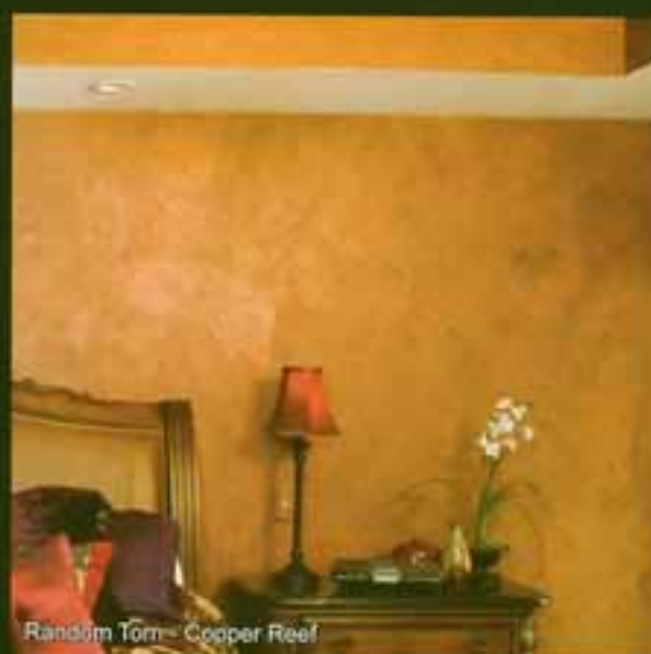
Random Torn™ - Copper Reef