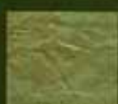
Janssen's Blue II